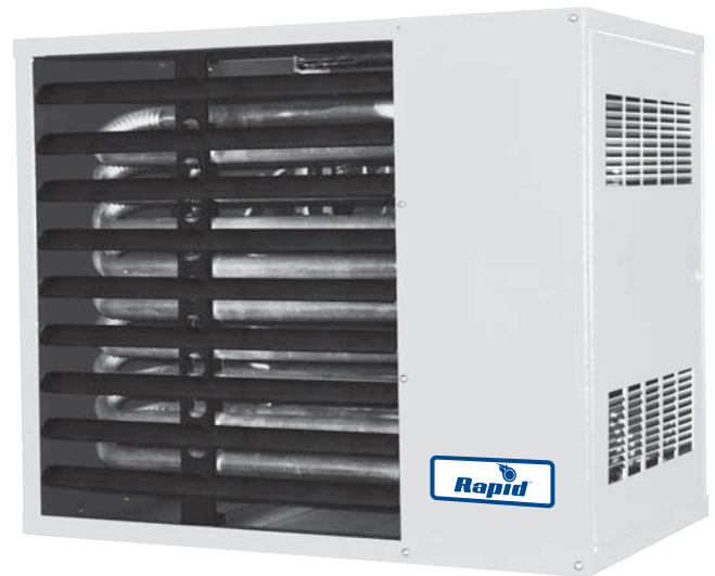
UHA Models 150 - 400 ▶