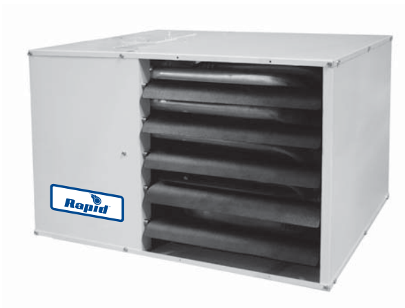
◀ UHA Models 30 - 125